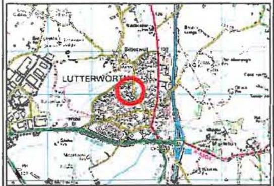
SITE LOCATION PLAN MAPINFO (C) Leicestershire County Council Leicestershire County Council 100019271 Published 2008